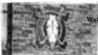
Watch Episode 1