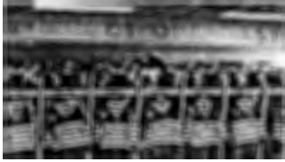
Watch Episode 8